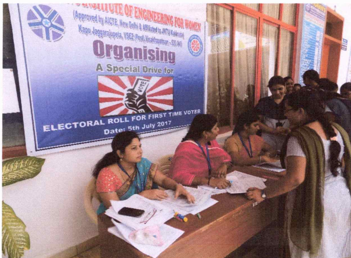
Students collecting registration form at help desk

Objective: To encourage more young voters to take part in the political process and awareness on importance of vote.