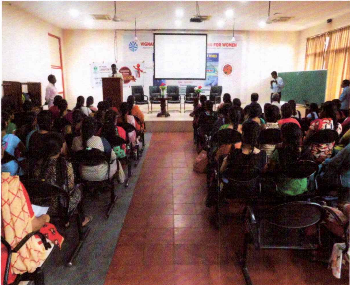
Participants in Corruption free India awareness program

Approved by AICTE, New Delhi & Affiliated to JNTUK, Kakinada