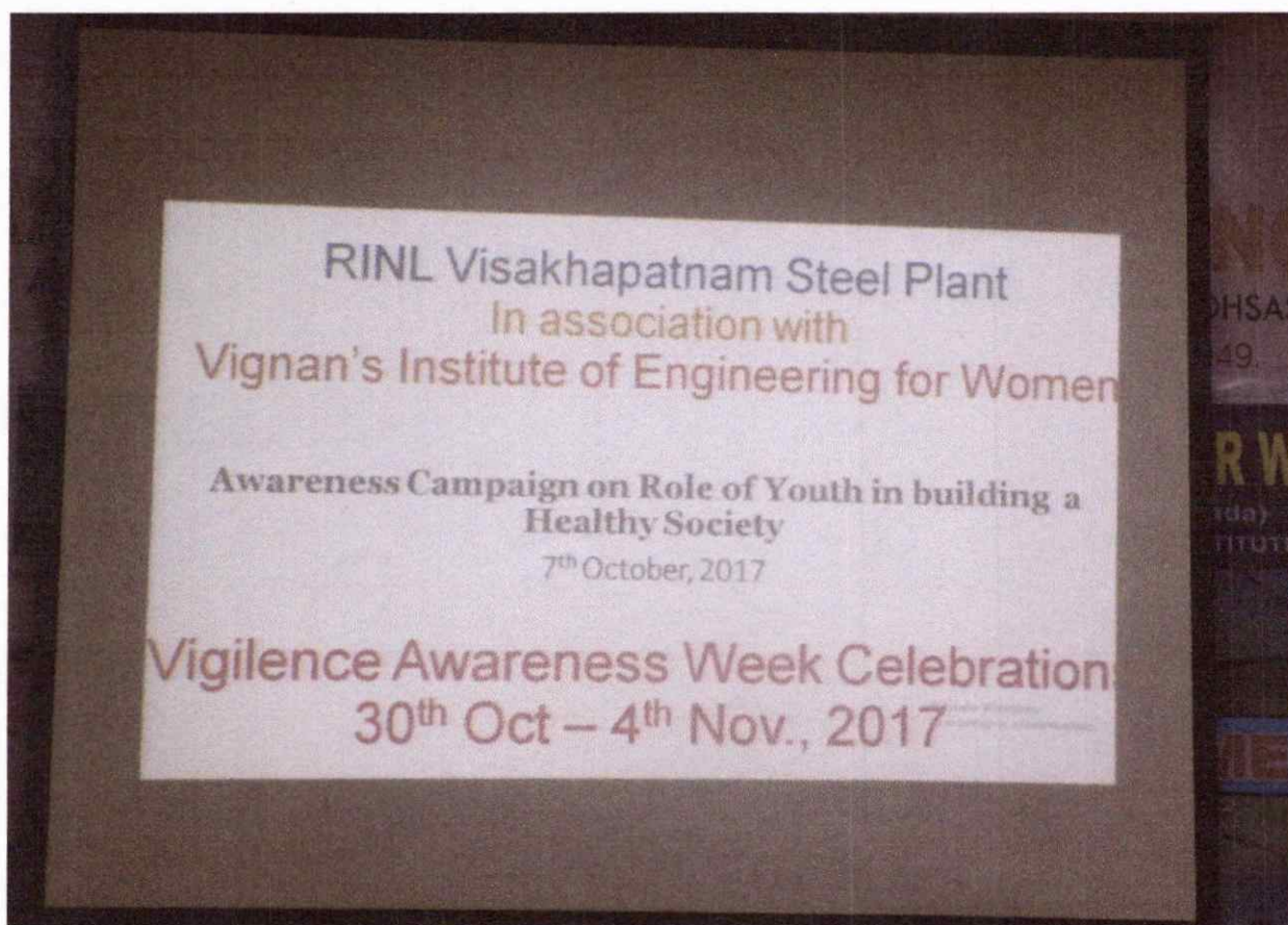
Awareness campaign on Role of youth in building a healthy society

Objective: To create awareness on building a healthy Society and corruption free India.