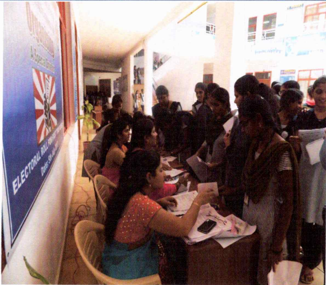
Registration in Electoral roll for first time voter

Approved by AICTE, New Delhi & Affiliated to JNTUK, Kakinada