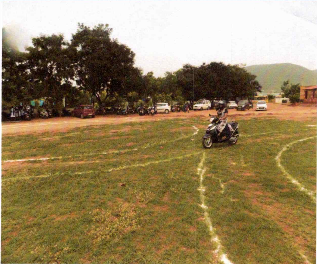
Learner's License Test in campus

Approved by AICTE, New Delhi & Affiliated to JNTUK, Kakinada