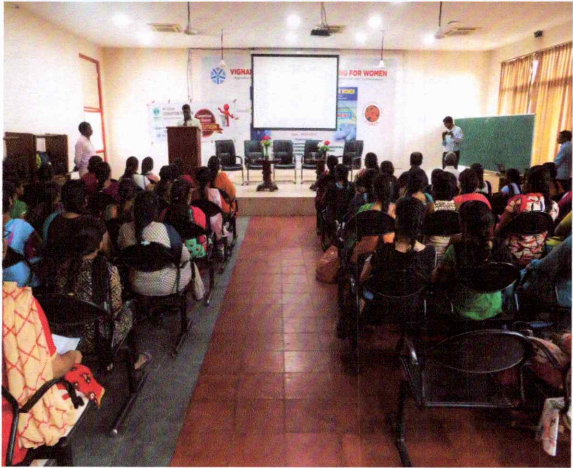
Participants in Corruption free India awareness program

Approved by AICTE, New Delhi & Affiliated to JNTUK, Kakinada