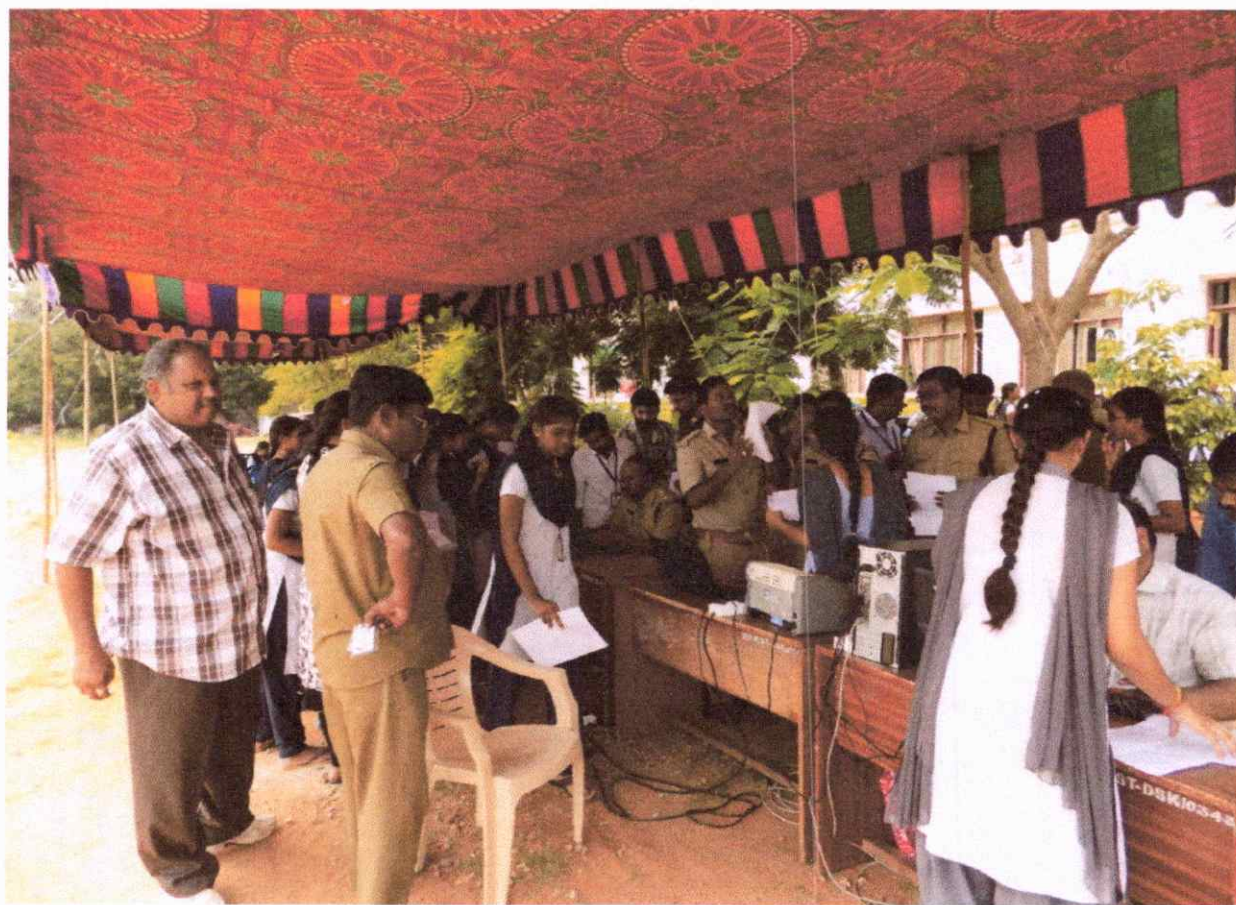
Students Registration in LLR Mela

Objective: To facilitate the issue of learners driving license to eligible students with in the campus